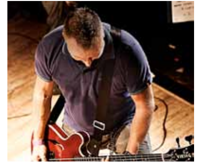
Peter Hook (New Order): GS1 Warsaw Strap