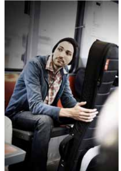
David Greco: M80 Single Guitar Case

MONO's M80 Series is a new breed of hybrid instrument cases for music industry professionals. The M80 Series is the result of MONO's intuition and observations, combined with an obsessive industrial design and prototyping process, all to create the ultimate collection of gear for the touring musician. Each piece is engineered to shave off pounds of unnecessary weight (the M80 Electric Guitar case weighs a mere 83oz), while remaining rigid in all the right places to protect your most prized possessions. Indestructible materials, lightweight construction, smart features.