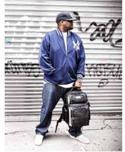
DJ Clark Kent: EFX Flyby DJ Case

The 365 DJ Pack is the result of ground-zero research and prototyping conducted among some of the world's most respected international DJs. When you wake up in a different country every week, mobility takes on a whole new meaning. The 365 is built for life in motion. MONO has combined intelligent features, bomb-proof construction, and a low profile form factor specifically for air travel. On the inside, smart storage puts everything in its place. On the outside, minimalist design detailing creates an element of mystery.